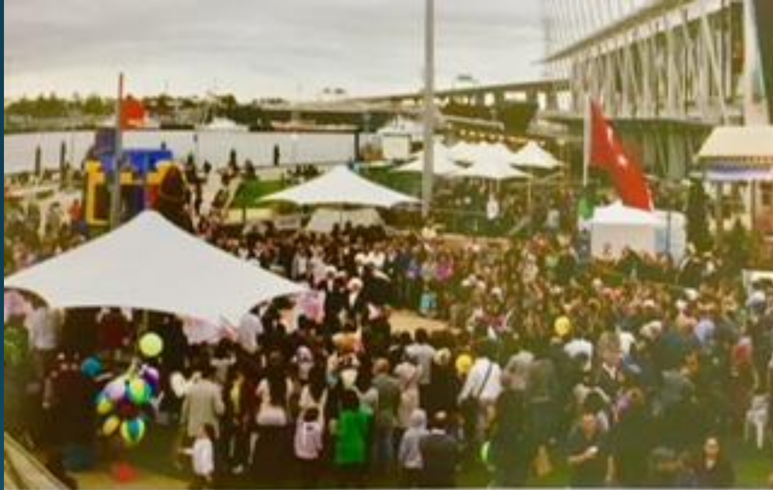
Saves from the Australian Culture and Arts Festival organized by the Melbourne Young Businessmen Association at Docklands