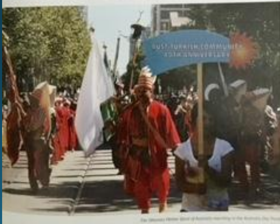
The Gust Turkish Community 20th Anniversary Parade