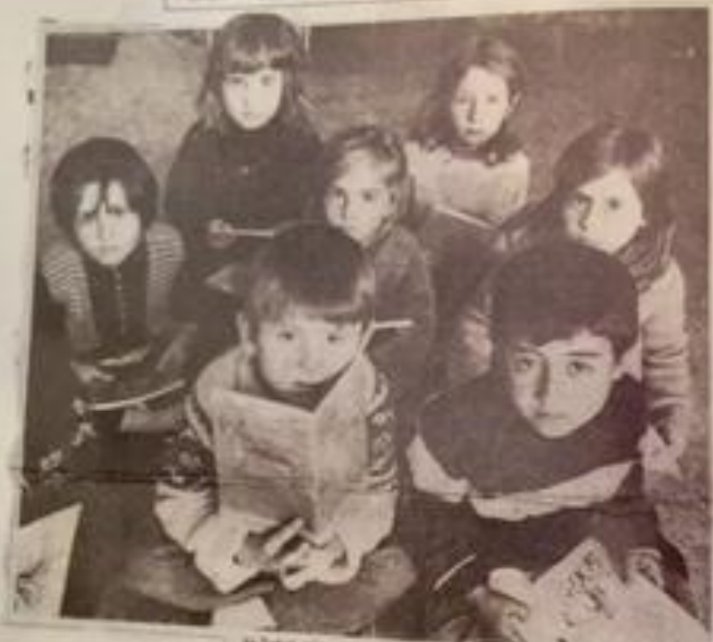
Members of the Young Children of the World & Study Club

As the children read, they learn to love books and to love each other. Members of the Young Children of the World & Study Club are shown reading books. Members of the Young Children of the World & Study Club are shown reading books.