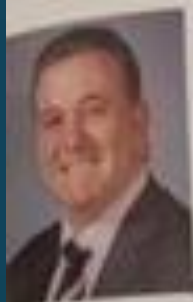
Portrait of a man in a suit and tie.