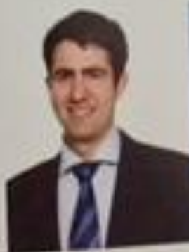
Portrait of a man in a suit and tie.