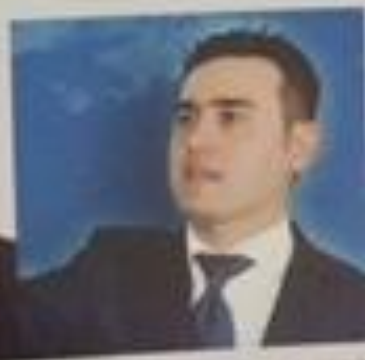
Portrait of a man in a suit and tie.