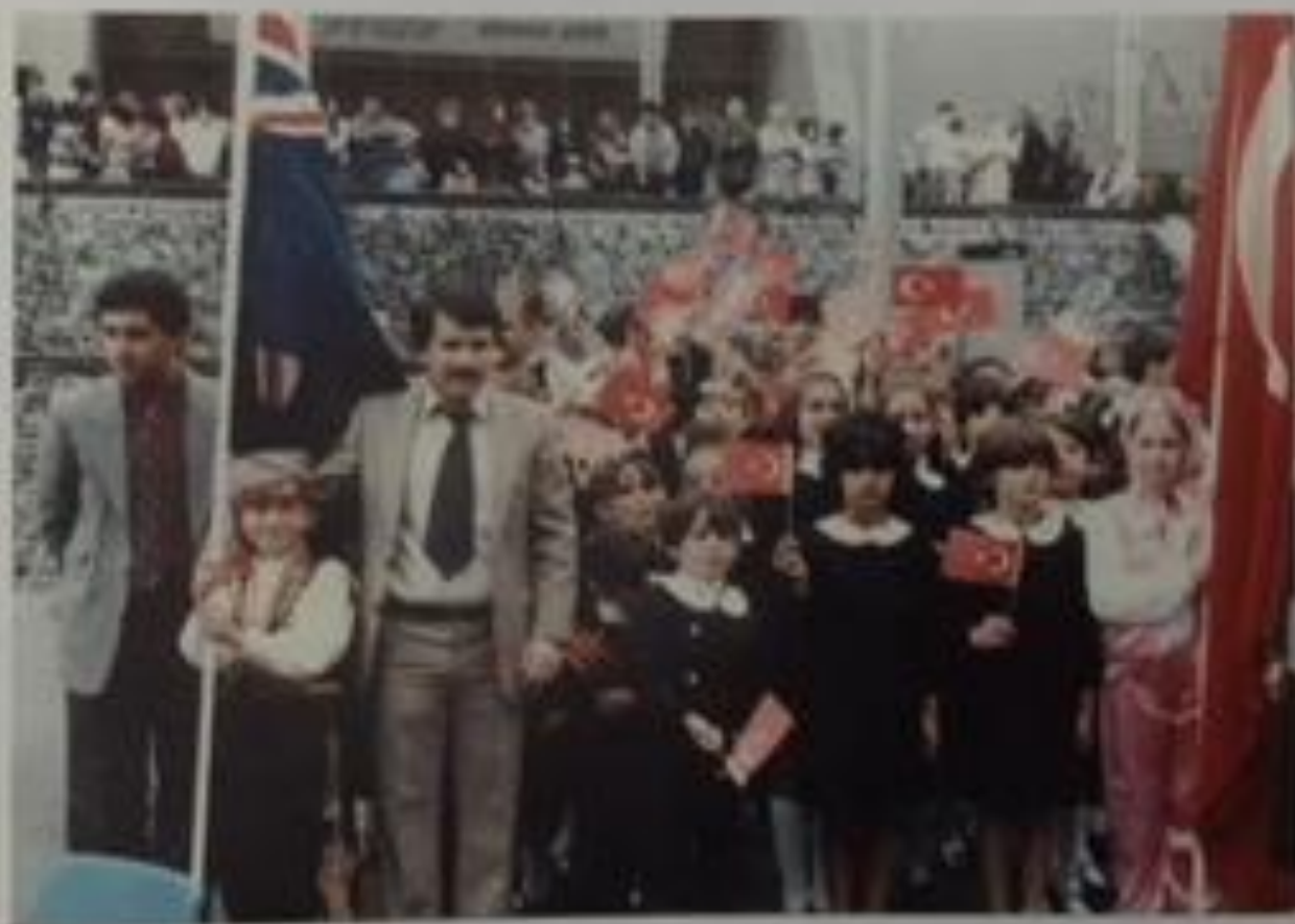
Students from Turkish School Melbourne celebrated the 100th anniversary of the ANZAC Gallipoli landing in 1915.