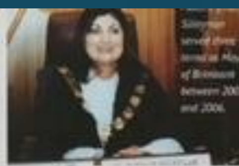
Sirhan served three terms as Mayor of Brisbane between 2000 and 2006.